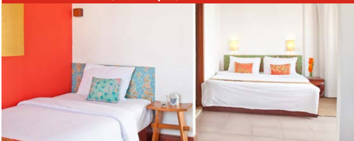
DELUXE TWIN ROOM (26 - 30 sqm*)