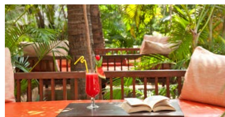
The Tea Garden

A small gym with treadmill, bike, elliptical, weights, yoga mat & weighing scales.