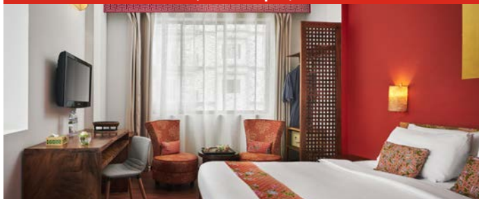
SUPERIOR DOUBLE ROOM (21 - 23 sqm*)