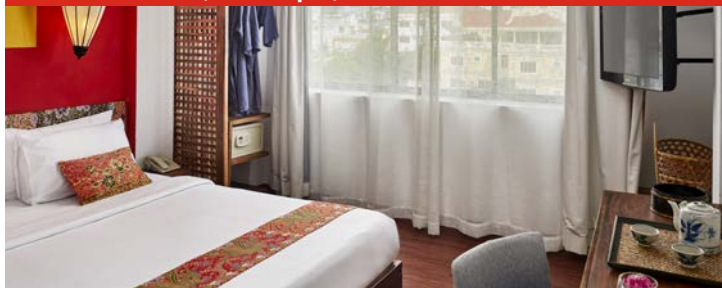
STANDARD ROOM (16 - 18 sqm*)